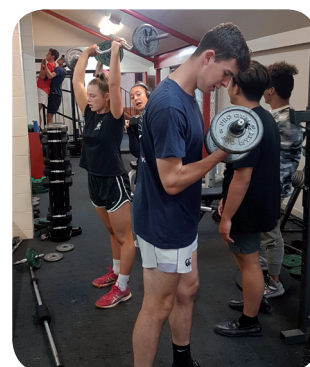
Pictured are the year 13 PE 'gym bunnies' doing their thing.

After each exercise session we have to make journal entries describing the session and linking the exercise to training methods and principles (such as overload, specificity and rest). At the end of the unit students complete a final test and then submit an essay with all the details of their training programme.