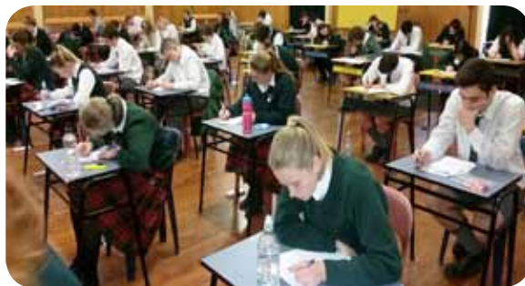
Senior students working hard in an exam

All students who sat school exams worked really well in exam week. The grades generated from these are used if a student cannot sit an external exam and apply to NZQA for a derived grade. They also give valuable practice at sitting assessments in pressure situations. We encourage all students to reflect on their school exam performance and make any necessary adjustments to their study programme to improve their performance. Students should also check Edge and NZQA to see that all internal and external entries are correct. If there are any issues with incorrect or missing standards the student is to see their subject teacher first and then Mr Wilkinson. Any late entries must be actioned by the end of week one in Term 4.