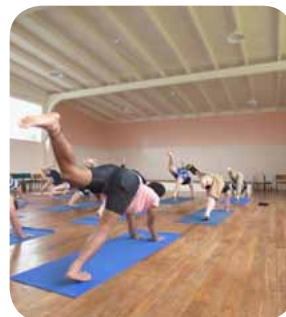
Year 13 students at Edenview Camp

The Year 13's were also asked to present a speech about what they considered 'success' to be, here are some of their thoughts: